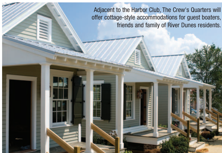
Adjacent to the Harbor Club, The Crew's Quarters will offer cottage-style accommodations for guest boaters, friends and family of River Dunes residents.