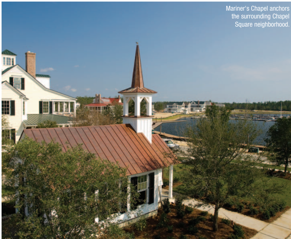
Mariner's Chapel anchors the surrounding Chapel Square neighborhood.