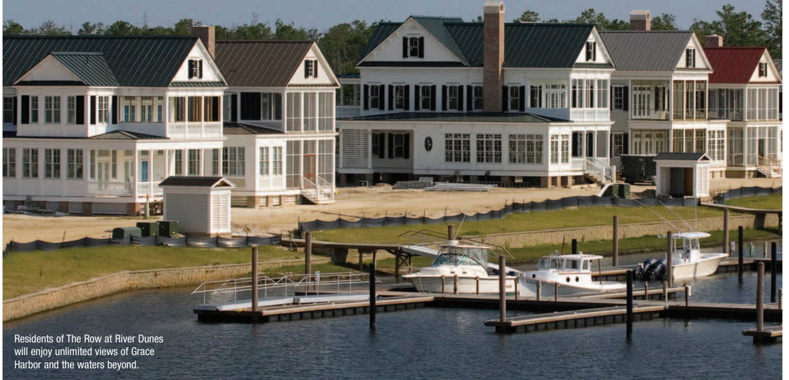
Residents of The Row at River Dunes will enjoy unlimited views of Grace Harbor and the waters beyond.